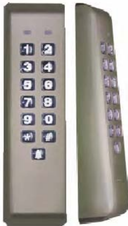
TA-1433-BZ Bronze Finish Mullion Keypad

These keypads are elegantly designed, with backlit keys suitable for indoor and outdoor applications. Each keypad demonstrates superior durability in any environment. The TA-1433 keypads mount directly to mullion doorframes or any flat surface. No backbox required. In addition, for convenient installation the TA-1433 keypads feature a separate doorbell key and relay. Durability, ease of installation, and attractive design make the TA-1433 a solid addition to any TAC installation.