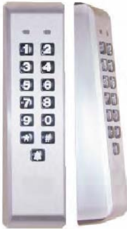
TA-1433-AL Aluminum Finish Mullion Keypad